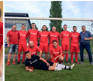
Participation in sport events