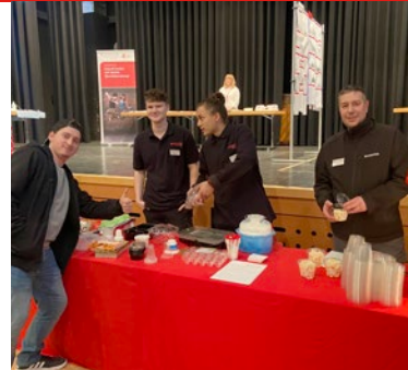
KIEFER at the training fair